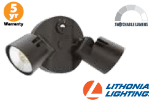
HGX-LED-2RH-ALO-40K-120-PE-DDB Lithonia LED 2-Head Residential Security Flood w/ Adjustable Lumens, Button-type Photocell, Dark Bronze, 120v, 15-25W, 1750-2750 lumens, 4000k, 80 CRI, Replaces up to 2 x 200w Inc.