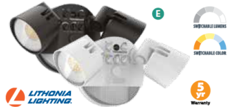
HGX-LED-2RH-ALO-SWW2-120-PIR-DDB – Dark Bronze HGX-LED-2RH-ALO-SWW2-120-PIR-WH – White Lithonia LED 2-Head Residential Security Flood w/ Motion Sensor, Adjustable Lumens & CCT, 120v, 21-26W, 2150-2600 lumens, 3000k-5000k, 80 CRI, Replaces up to 2 x 200w Inc.