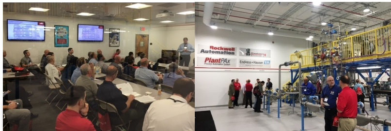
Architecture of a "mini process plant" presented at the Process Technology Unit: