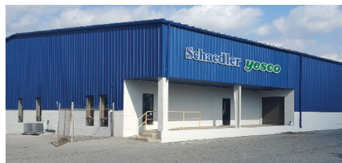
Photo files in email.

Caption: Schaedler Yesco Distribution moves Allentown location to 601 Highland Street.